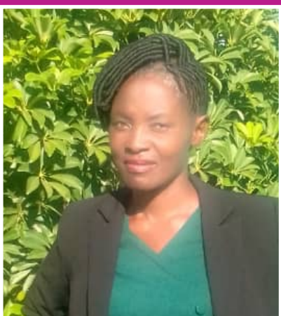
We feel honoured, as women. Our rights are now being considered and empowerment is now benefitting everyone without discrimination