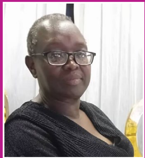
Wathinta umfazi wathinta imbokodo (You strike a woman, you strike a rock, you will be crushed)