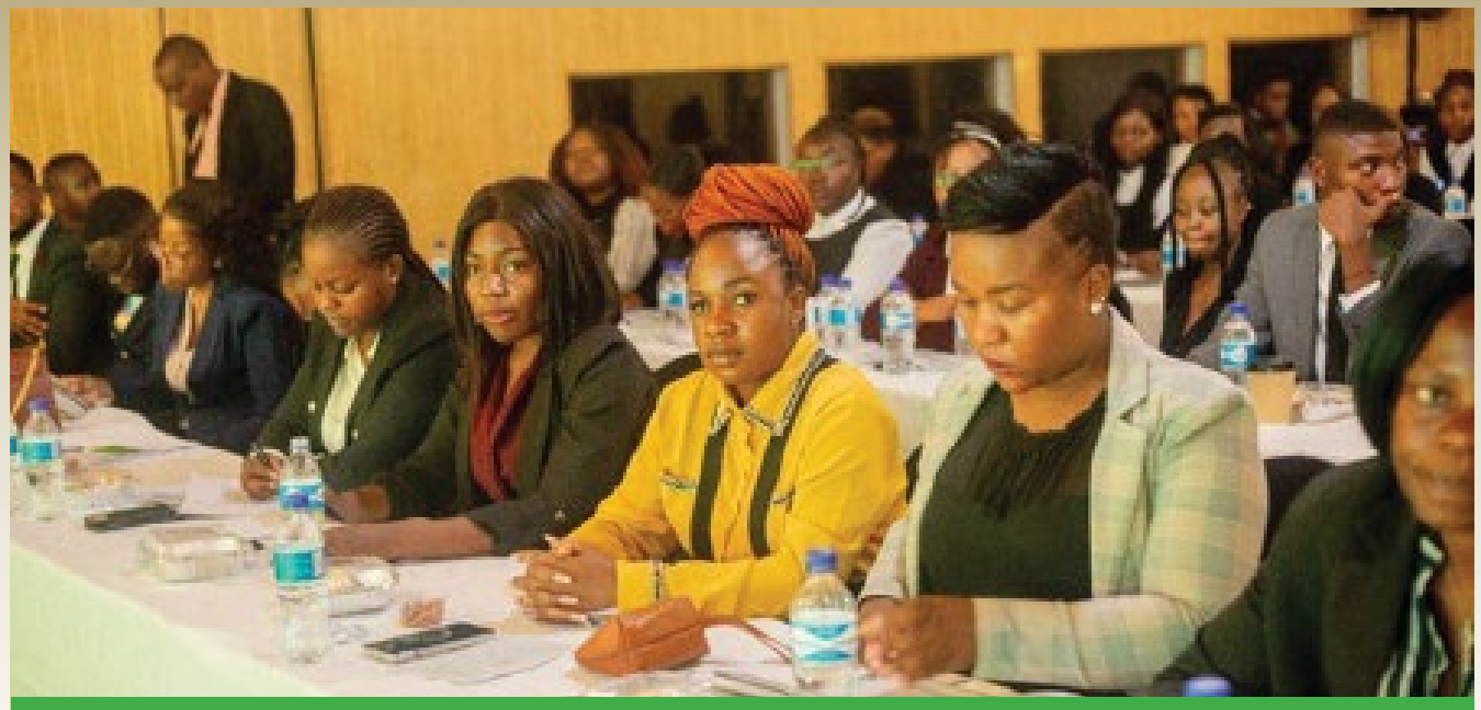
JSC researchers follow proceedings at a recent training session in Harare.