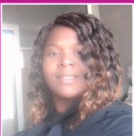
Giving women space to work, supporting their entrepreneurial initiatives, and involving them in key decision-making spur socio-economic development.