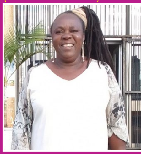
As women, we are breaking the glass ceiling. I am grateful to the authorities for giving women unlimited opportunities in social, economic, and political spheres.