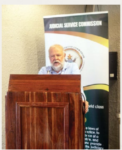
Law reports editing trainer makes a presentation during the training session.

The global recognition and acceptance of legal judgments hinges upon their quality and meticulous editing."