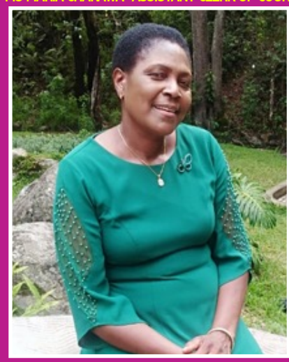
In March we celebrate the achievements by women in various sectors of the economy like agriculture, mining, tourism and others.