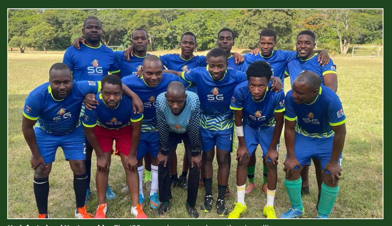
Undefeated and Unstoppable: The JSC soccer dream team keeps the wins rolling