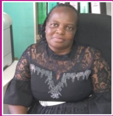
In the past, women were viewed as lesser beings who could not even run a business. This has however, changed through women's empowerment.