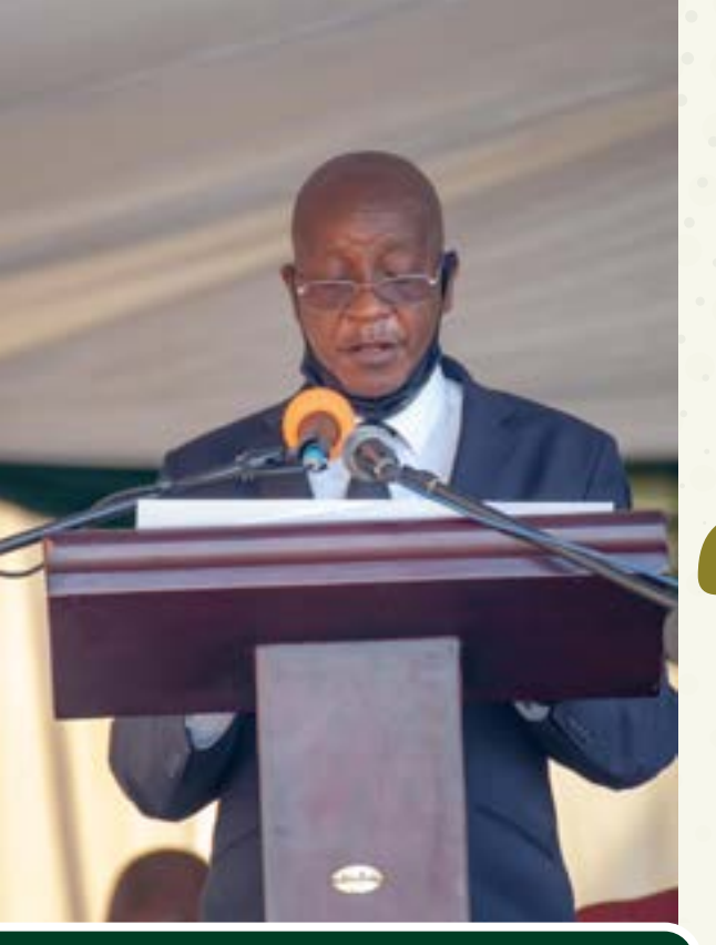
Honourable Minister Z. Ziyambi